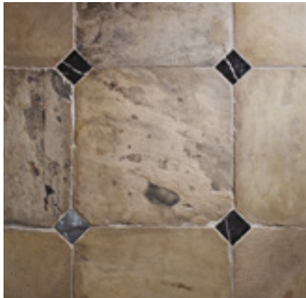
ANTIQUE ENGLISH OCTAGON