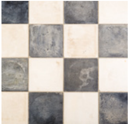
SPANISH GREY CORDOBA MARBLE