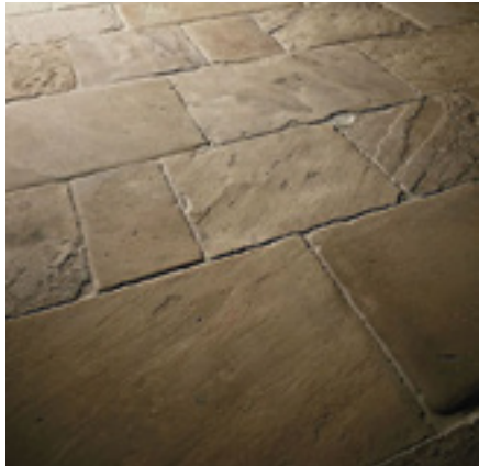
ANTIQUE ENGLISH MEASURED COURSED