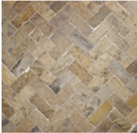
ANTIQUE ENGLISH HERRINGBONE