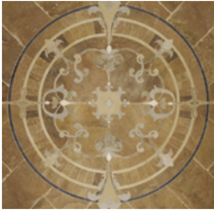
ANTIQUE ENGLISH CENTREPIECE