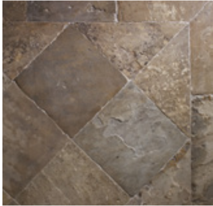
ANTIQUE ENGLISH SQUARE