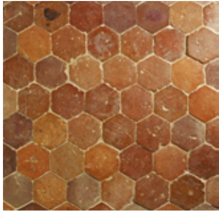
ORLEANS TERRACOTTA HEXAGON

A selection of genuine Antique Reclaimed stone, terracotta and marble floors from Lapidica's international collection. These form part of an extensive range of hard surface flooring options available from Lapidica.