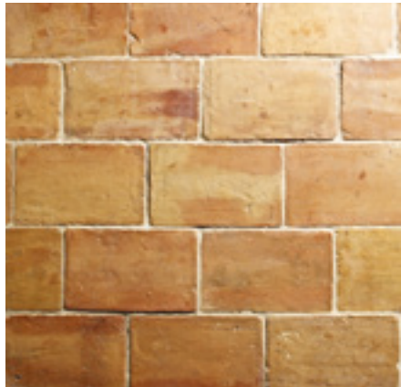
RECLAIMED PAREFEUILLE NIMES