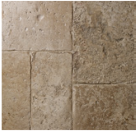
PIETRA DI ITALIA