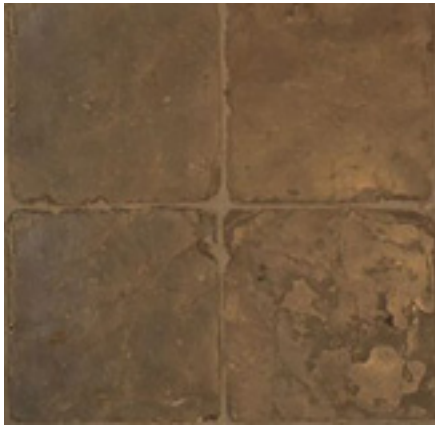
TARIFA SPANISH STONE