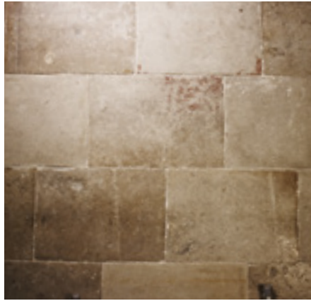
BARR DE MONTPELLIER