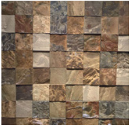
ENGLISH RECLAIMED HEATHCLIFFE