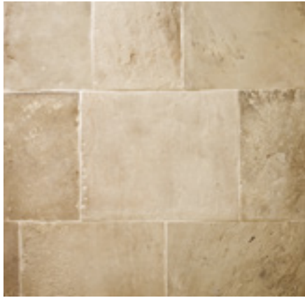
ANTIQUE ENGLISH SELECT