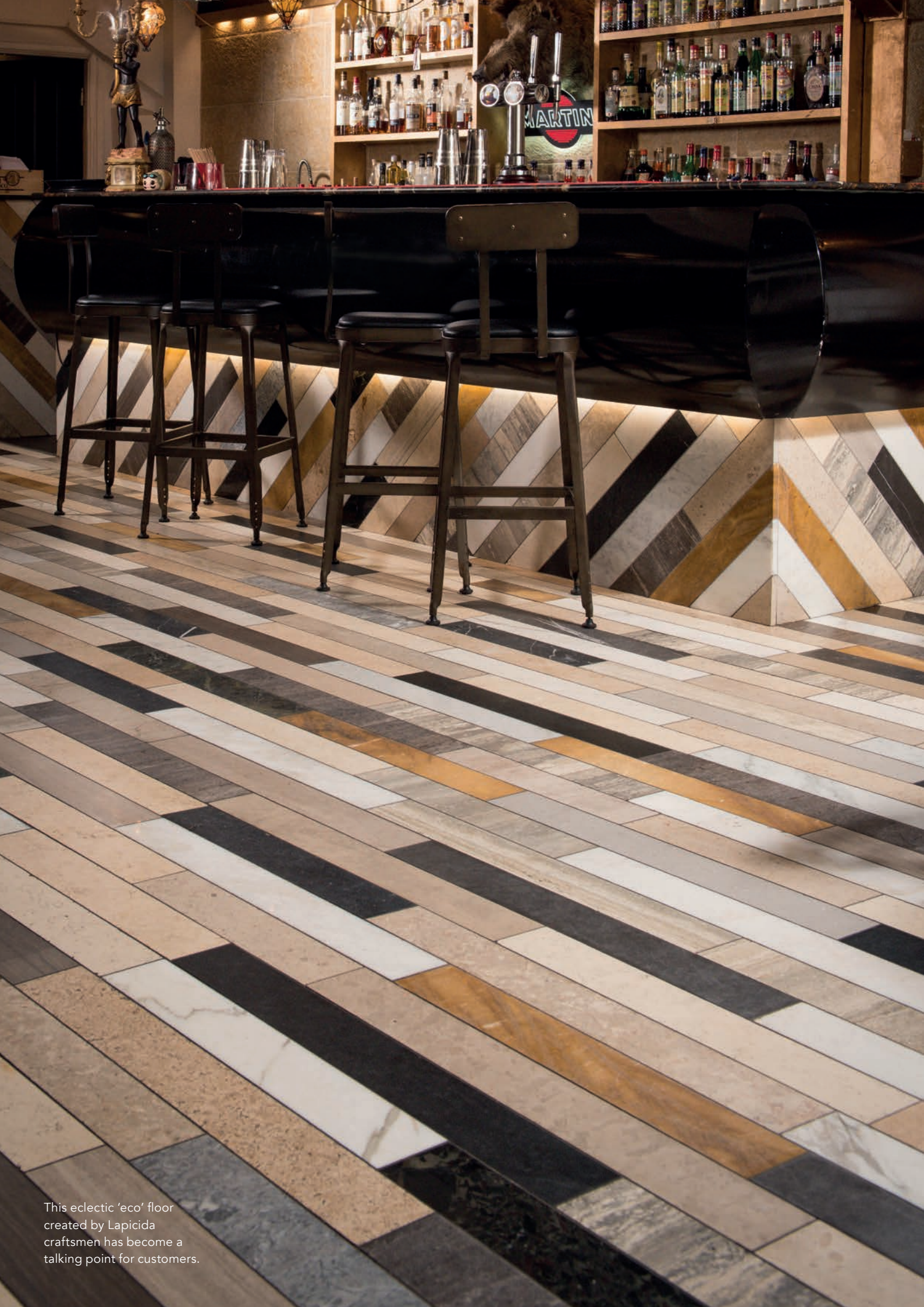
This eclectic 'eco' floor created by Lapidica craftsmen has become a talking point for customers.